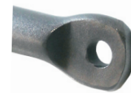
FIXED SWAY BAR