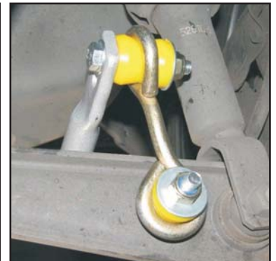
Photo 3. Link assembly - front view.