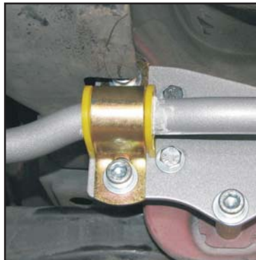
Photo 2. Swaybar mounting.