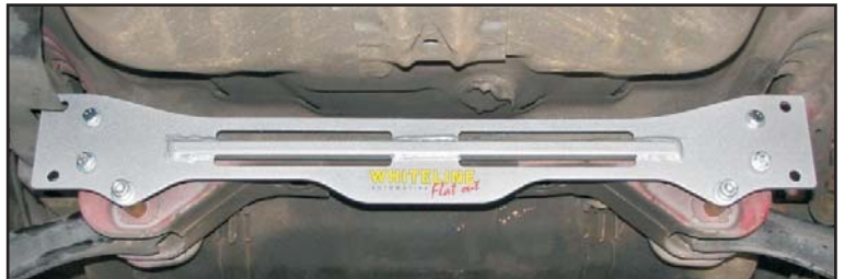
Photo 1. Chassis bracket.