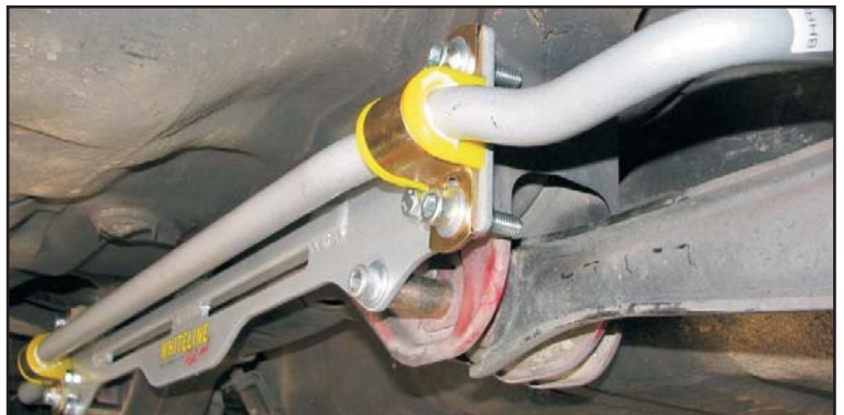
Photo 4. BHR83XZ complete assembly - side view.