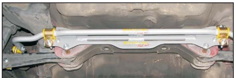
Photo 5. BHR83XZ complete assembly - rear view.

Warning: Please drive carefully while you accustom yourself to the changed vehicle behaviour.