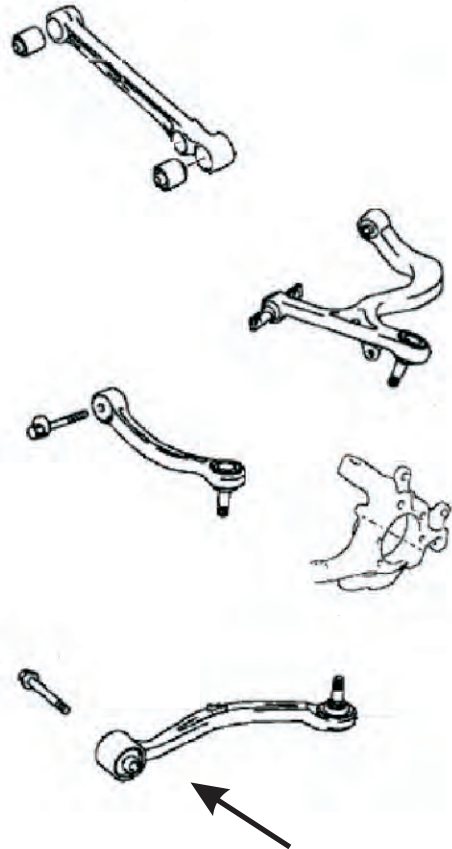
Lower Trailing arm and bushing

Contents - 2x 1-piece bushings - 2x Steel tubes 25.4x14.3x70 - Grease