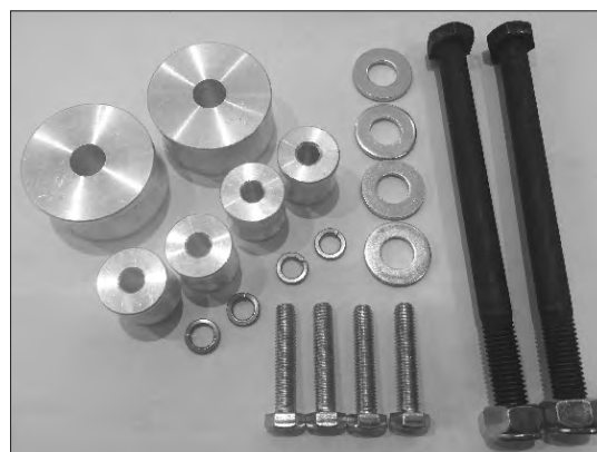
Front aluminium spacers