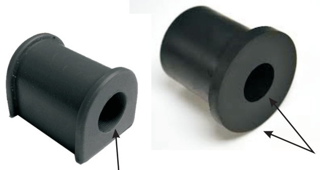
Grease bushing face and ID only